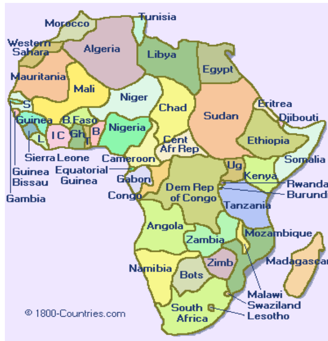
Figure One: A Map of Africa (2010)

(Bislev and Salskov-Iversen, 2001; Pollitt, 2003; Therkildsen, 2000). Under the banner of structural adjustment, a series of economic and political measures were to be undertaken by developing nations in return for loans/aid and these measures included NPM reform. In the Africa nations (see Figure One), the NPM model of reform has often been a condition of international donor aid in the belief that such reforms will 'modernise' the public sectors of these countries.